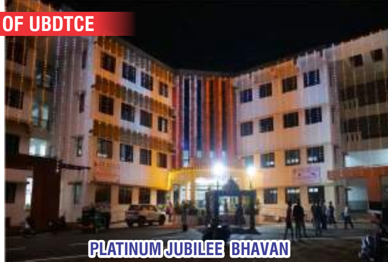
PLATINUM JUBILEE BHAVAN