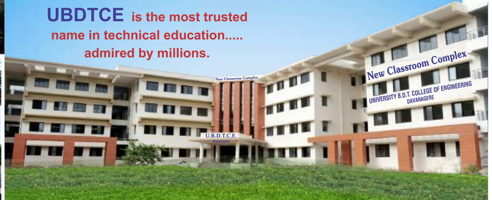
New Classroom Complex UNIVERSITY B.D.T. COLLEGE OF ENGINEERING DAVANAGERE

UBDTCE is the most trusted name in technical education..... admired by millions.