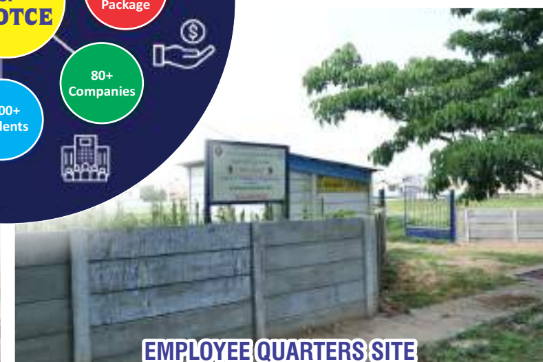
EMPLOYEE QUARTERS SITE